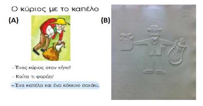
Figure 3. Initial text (A) and adapted in audio and Braille code (B).

Digital education materials for students with visual impairment. The knowledge and use of the Braille code by visually impaired people is a decisive factor for the development of basic and functional literacy, which will allow them to acquire a comprehensive school education and have equal opportunities for participating in lifelong learning and education. It is an educational material concerning the curriculum of teaching blind students Braille reading and writing and exposing them to Mobility Education, Orientation and Daily Living Skills (see Figure 3).