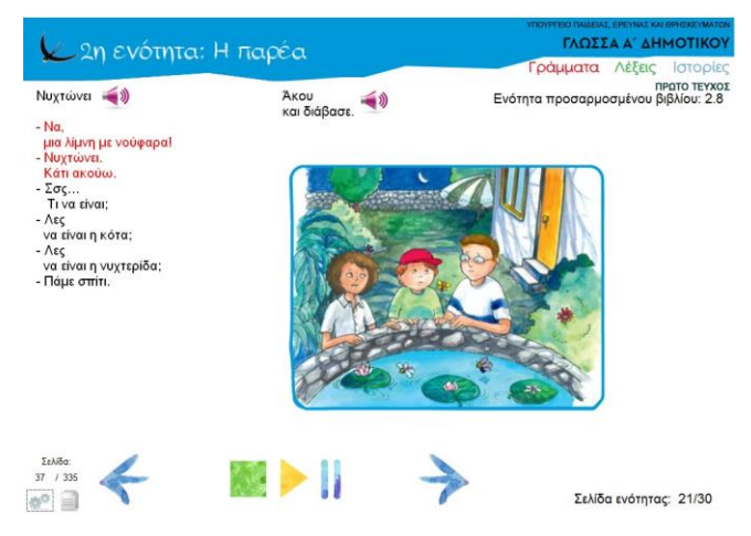
Figure 4. Simple text structure, simple vocabulary, visualized and audio text.

Accessible digitalised and printed material (easy to read texts for all students) from the textbooks (3<sup>rd</sup> and 4<sup>th</sup> primary school) – enriched, adapted and modified (simple text structure, simple vocabulary, visualized text, avoiding abstract notions etc.) according to each case. The adaptations follow the principles of the method easy to read (ECIE, 2009) for the reading comprehension of students with intellectual disability or reading difficulties. This method is illustrated in Figure 4.